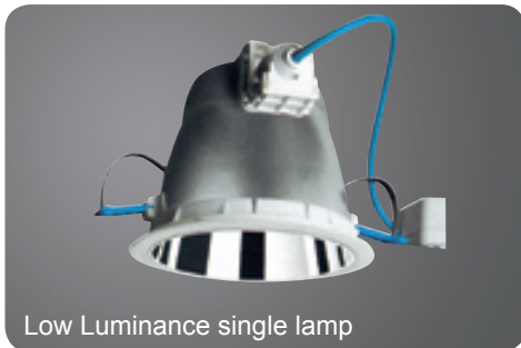
Low Luminance single lamp