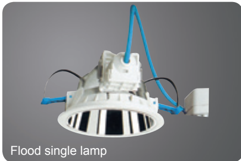
Flood single lamp